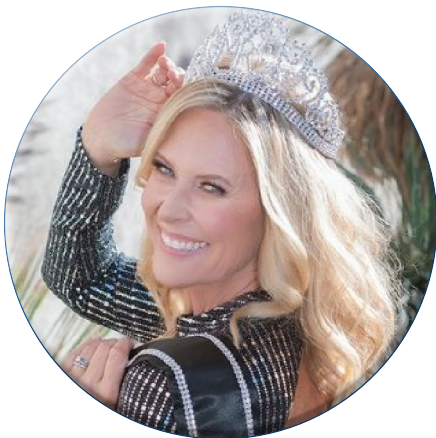
Mrs. American Queen 2021-2022