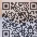
TTE YT Short Video

Understand how to leverage your influence to inspire change, drive success, and create a legacy of positive impact.