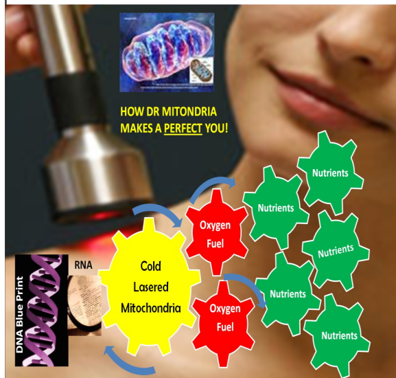
HOW DR MITONDRIA MAKES A PERFECT YOU!

So, come and join us for a dynamic consumer seminar that can potentially change your family's health status for the better. Call 520-509-6380 today to make your reservations as seating is limited. Be sure and bring your spouse and other family members and friends with you!